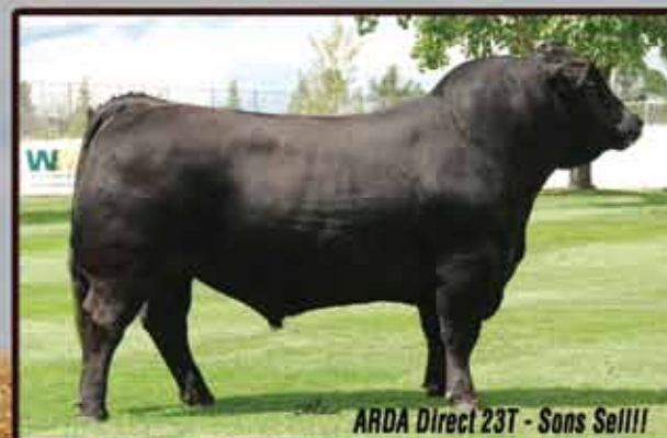
ARDA Direct 23T - Sons Sell!!